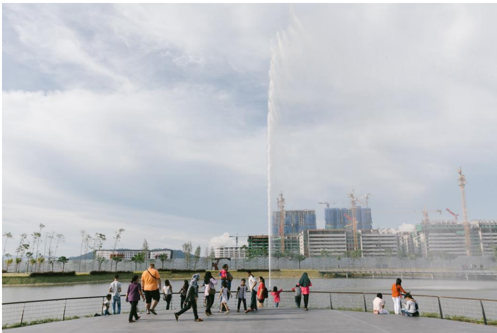
One of the highlights of the Central Island Park is the 52-metre high water jet