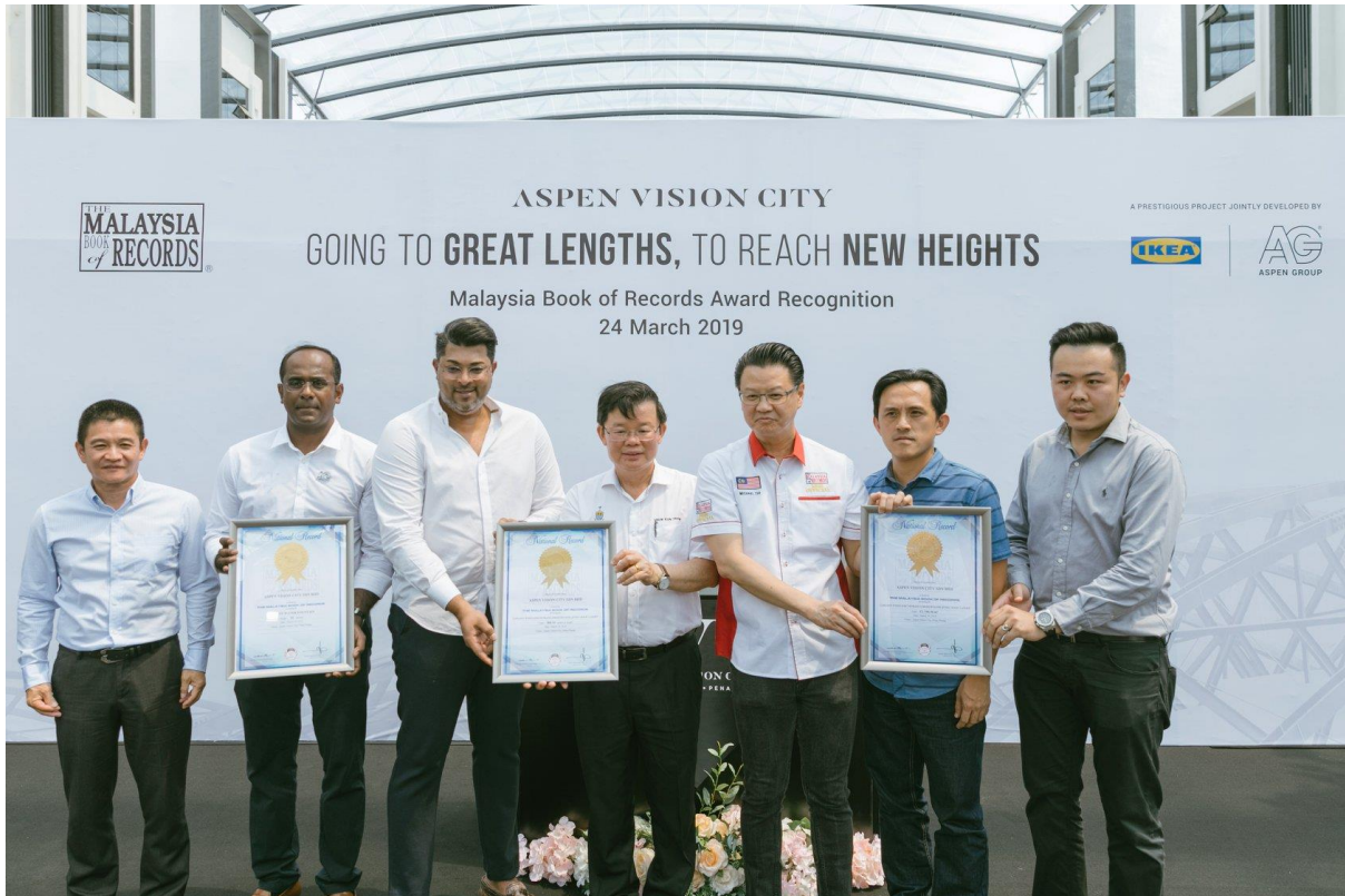
The Chief Minister of Penang also present and witnessed the Award Recognition Ceremony.