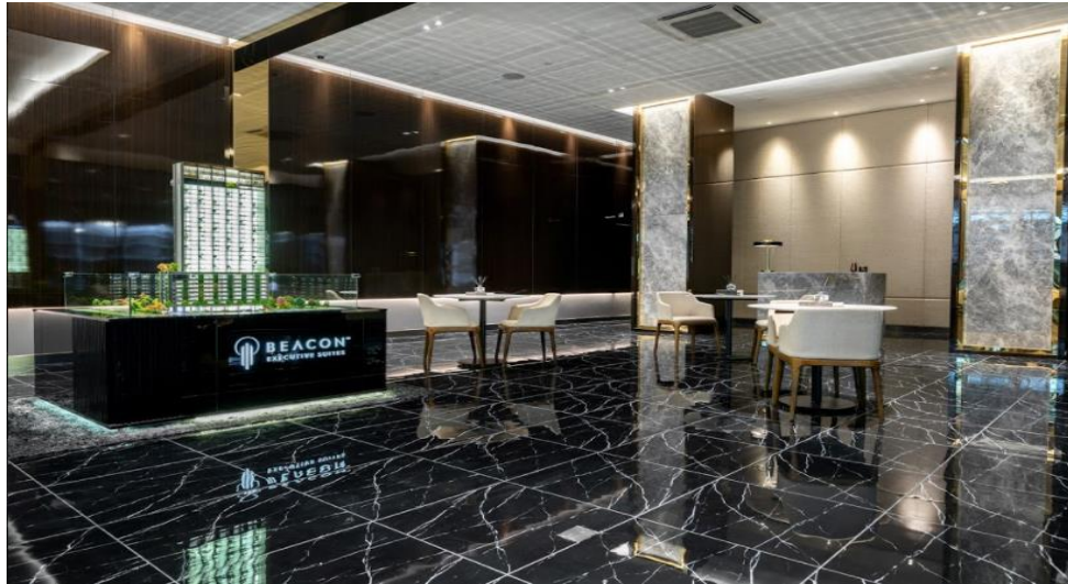
Beacon Executive Suites lobby

The Group expects the construction activities of its other on-going developments, namely Vivo Executive Apartment and Viluxe, to be affected slightly by the MCO 3.0.