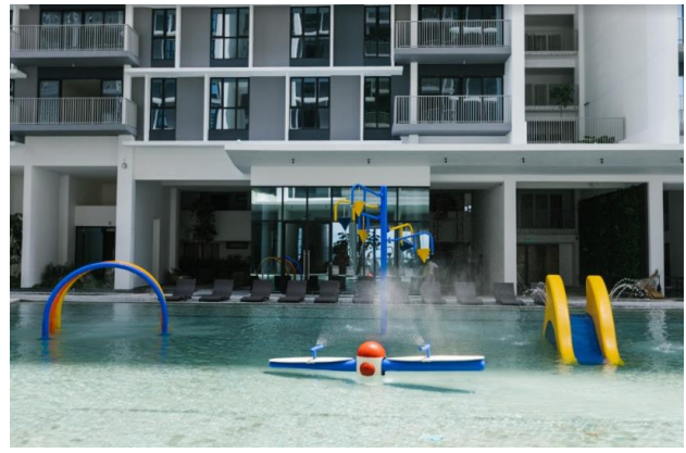
Vertu Resort Facilities

The homeowners of Vertu Resort are currently being welcomed in stages to collect their keys to their homes with strict adherence to the Covid-19 SOPs recommended by the MOH to prevent the risk of infection.