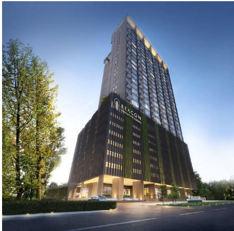
Beacon Executive Suites rendering

The Group has also completed the construction works for Beacon Executive Suites and expects to obtain the CCC by end of May 2021. It consists of 227 units of small office, home office (SOHO) residence within a 30-storey tower gracing the skyline of George Town.