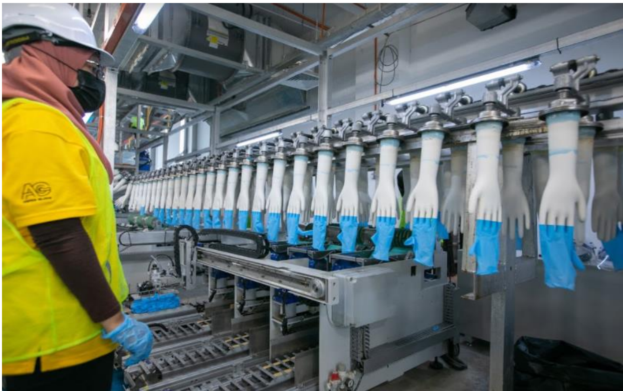
AGSB's fully automated glove stripping and stacking process

The construction works for AGSB's Phase 1 manufacturing facility have been fully completed and will house a total of 12 production lines. AGSB is currently in the midst of installing the machinery for its Phase 1(b) to include 6 additional production lines.