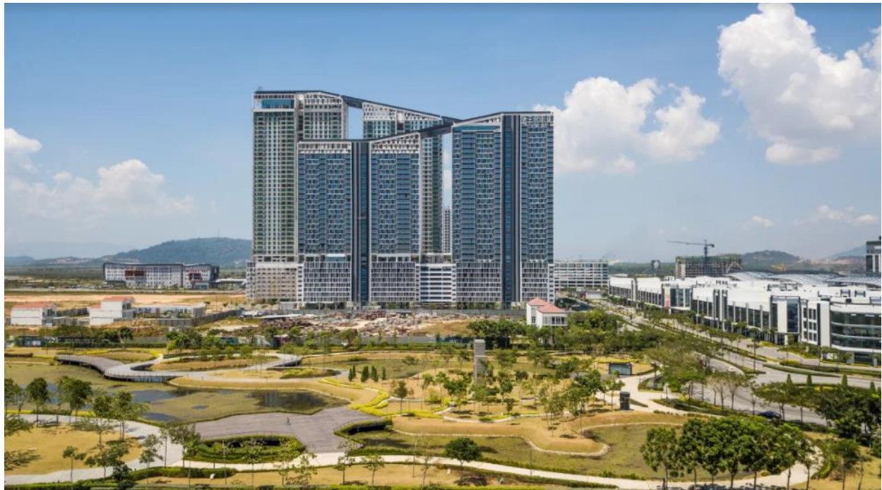
Vertu Resort Façade

The resort-inspired highrise development was conceptualised as a sustainable development, with vast eco-inspired features that meet the Green Building Index (GBI) Certification for the Silver rating. It consists of 5 condominium blocks ranging from 20-storeys to 36-storeys consisting of 1,246 units of condominiums built above an 8-storey car park podium with one storey above the car park for community recreational facilities.