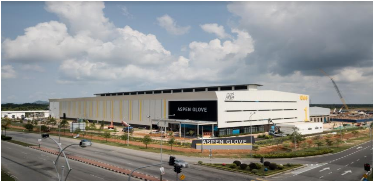
AGSB's Phase 1 manufacturing facility