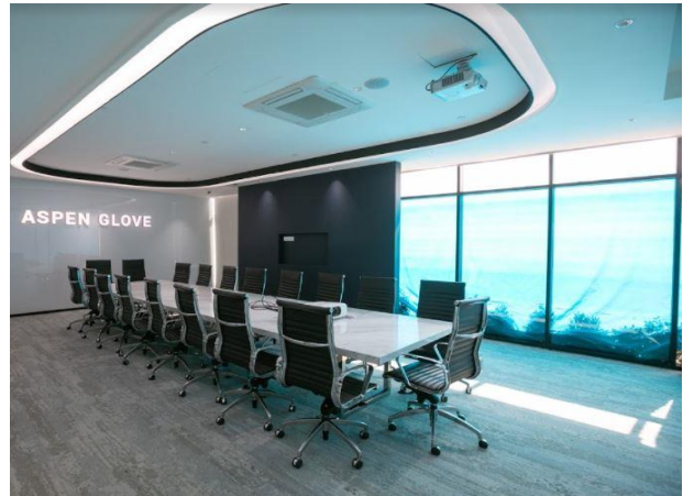
AGSB's corporate office